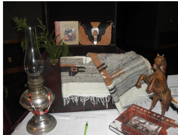
The Western-themed table.

When a friend donated an antique kerosene lamp to the project, Abbie put together a grouping of Western-themed items for the silent auction. She later learned that this special grouping brought an additional $175. The day of the auction, workers