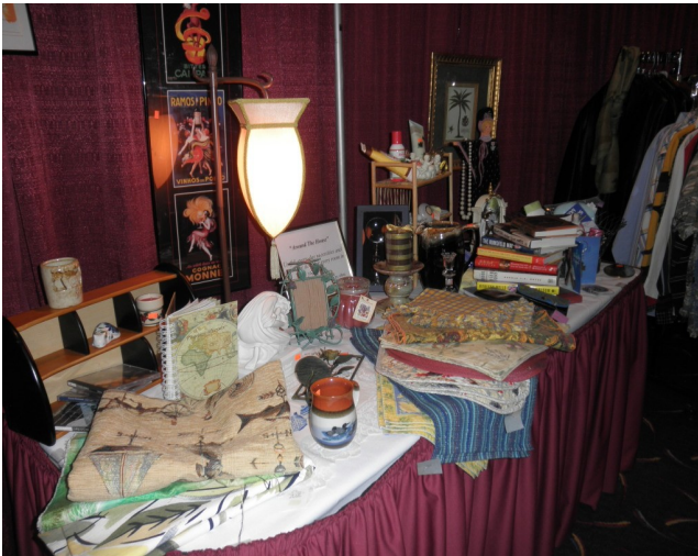
Household items on display.