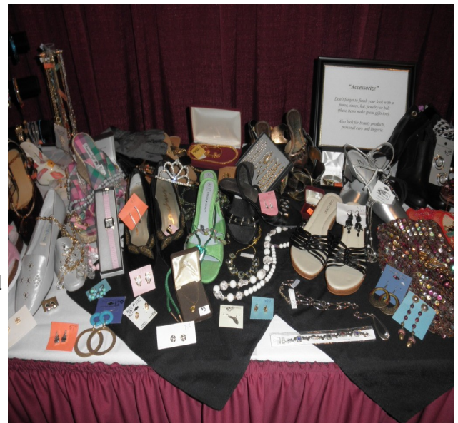
A grouping of accessories from the Thrift Store.

While thinking about how she could help, she visited the store, and was instantly impressed. "There's so much stuff there, and it's all so nicely displayed," she said, smiling warmly. That's when the idea hit her. "They always have a silent auction at the banquet, but not everyone can afford to bid on those items. A boutique showcasing items found in