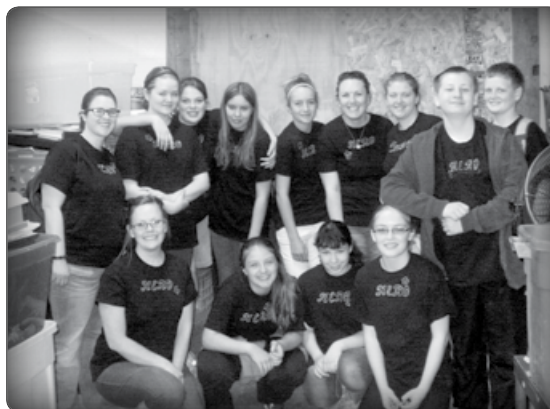
Volunteers from South Middle School Want to volunteer - call the Volunteer Dept. @ 718-8712

Phone cards, gas cards, bus passes Shoes & boots, sizes 10-13 Clothing sizes XXL and larger only