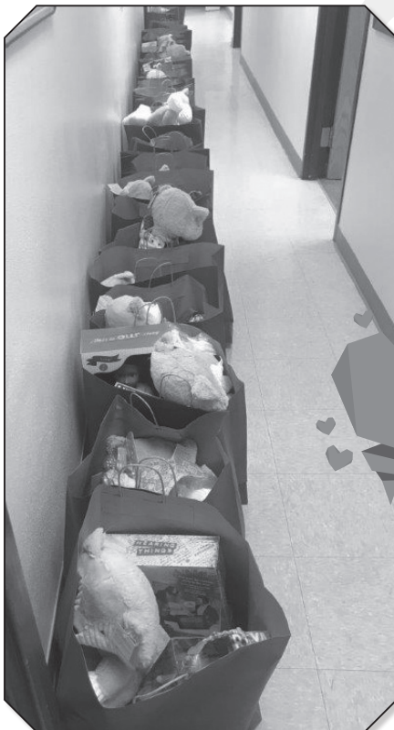
Each child of Cornerstone received a gift bag. 65+ bags were made up - all through the generosity of donations!