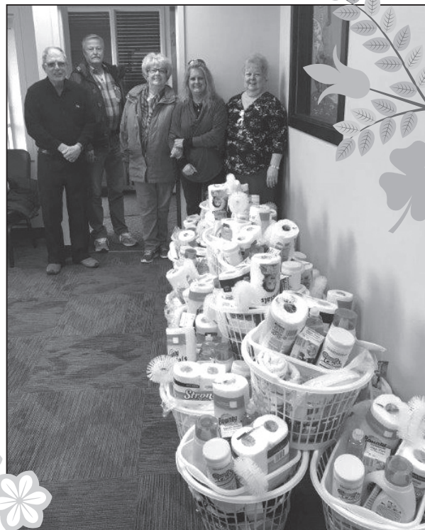
The Elks Club donated 20 baskets full of household items to the Veterans. These baskets are given to Veterans when they get their own place. Such a special gift!