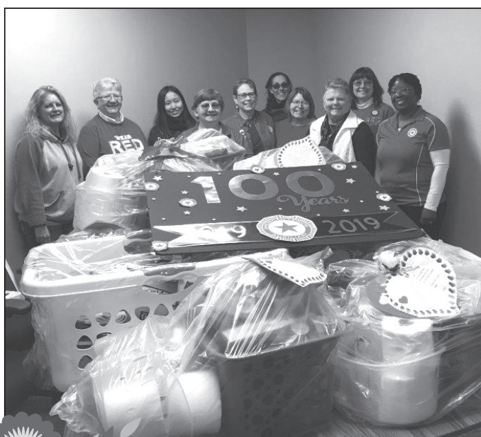
American Legion Ladies Auxiliary from Spearfish brought move-in baskets and Valentines for the Veterans. These ladies are so good to our Veterans!