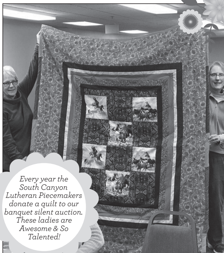
Every year the South Canyon Lutheran Piecemakers donate a quilt to our banquet silent auction. These ladies are Awesome & So Talented!